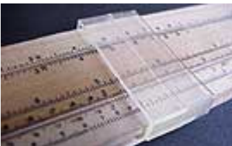
The Alpha Powered Slide Rule

Technical people often have a "marketing firewall" that filters out anything perceived as marketing or sales.